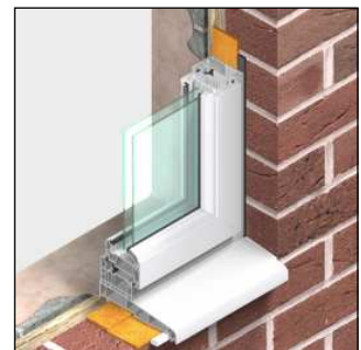
Fig 2 TP610 and FM330 installed

construction site away from direct sunlight. A small fridge is ideal for this.