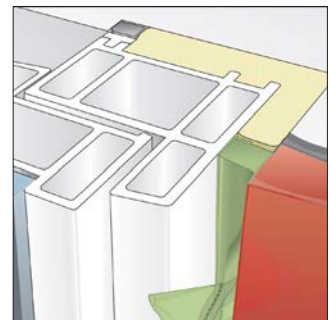
Fig. 4 TP601 Compriband e located to perimeter of window (check reveal shown)