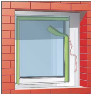
Fig. 1 Fix TP601 Compriband e onto the window frame using the self-adhesive backing

Safety data sheet must be read and understood before use.