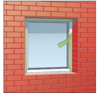
Fig. 2 Activate the expansion of TP601 Compriband e by removing the film and thread